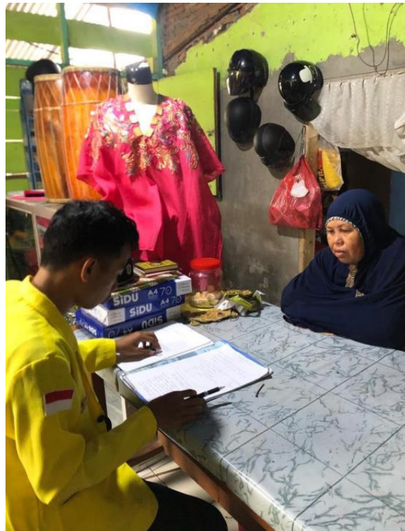
Figure 6. Interview with the Owner of Agnes Collection Baju Bodo

A culture of shame (siri) is crucial for every individual to maintain their dignity and honor as servants of Allah. Furthermore, maintaining a culture of shame (siri), not merely integrity among employees in the workplace is crucial for safeguarding their good name, the company's reputation. Within the Maqasid al-shariah approach, a culture of shame (siri) is considered a means of safeguarding one's lineage (hifz al-nasl) by encouraging responsible conduct and preventing behaviors that may bring social sanctions and damage family honor. One concrete example is that employees who fail to implement a culture of shame in the workplace will damage their reputation, that of their family, and especially that of the company, by engaging in inappropriate work practices. Islam emphasizes the importance of a culture of shame in the workplace, as it impacts both the employee's and the company's reputation, which must be maintained.