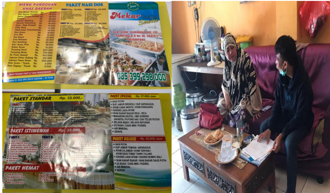
Figure 5. Interview with the Owner of Mekar Catering